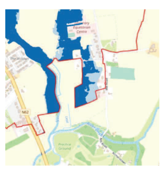
SFRA, NIFM Present Day 1% and 0.1% AEP SFRA, Flood Zones A and B extents