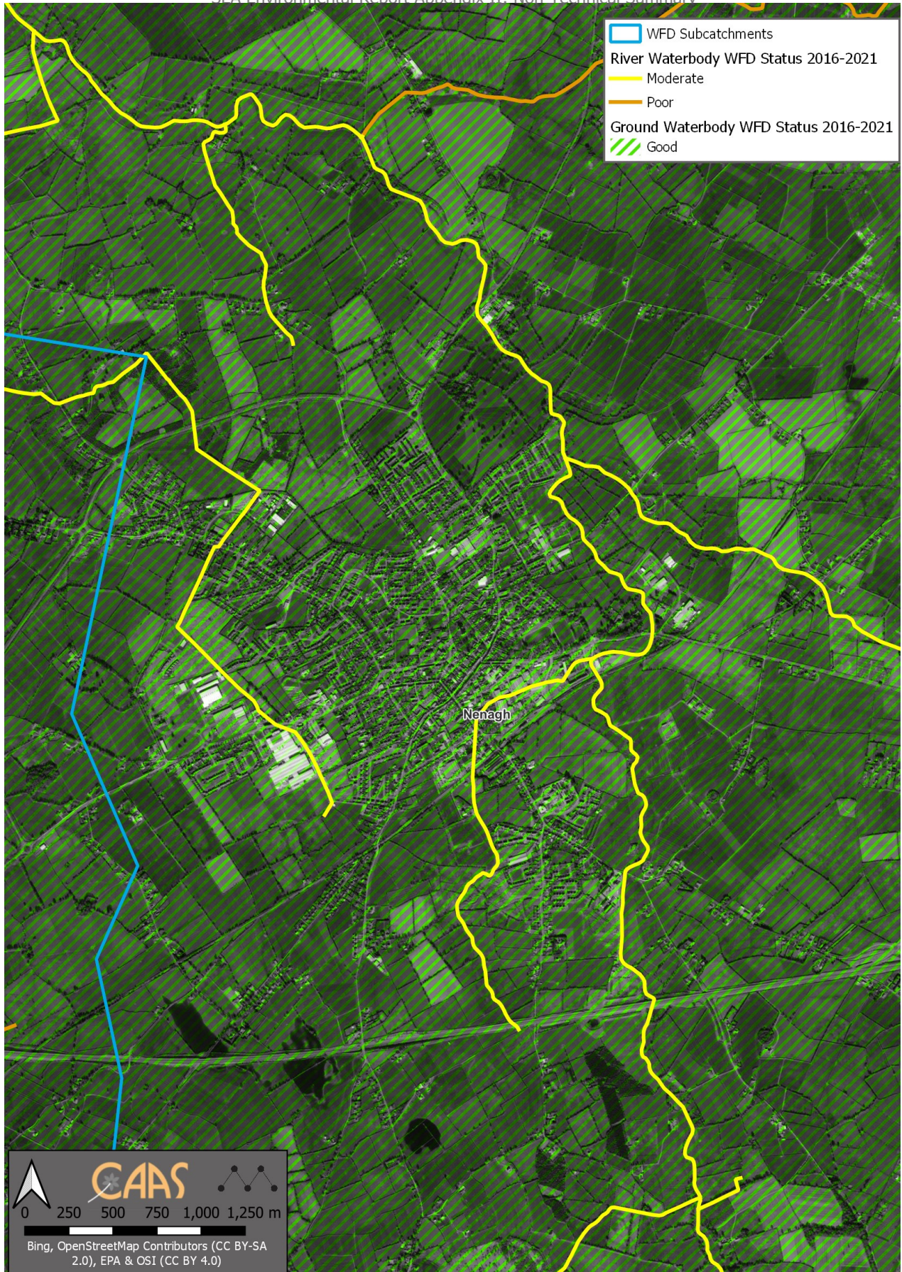
Figure 3.2 Surface Water Status (2016-2021)