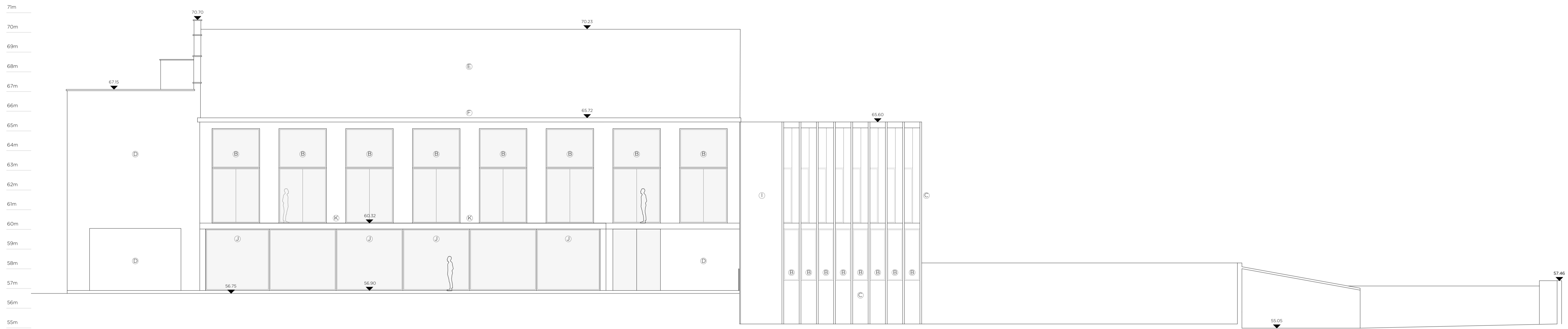
WEST ELEVATION _ PROPOSED