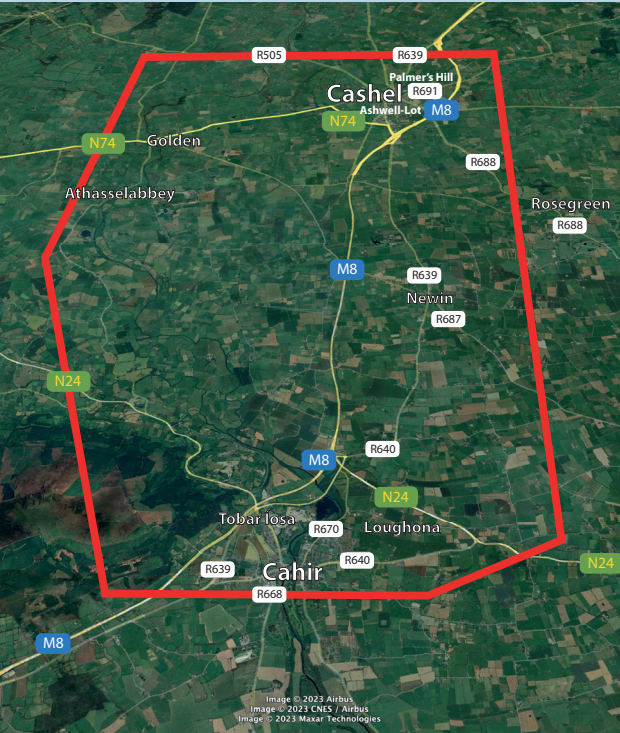
Proposed Study Area

The Project Team would like to hear your views in relation to the study area that you want the project team to be aware of i.e. constraints, opportunities, concerns, key features, attractors, etc. This information will inform the development of route options.